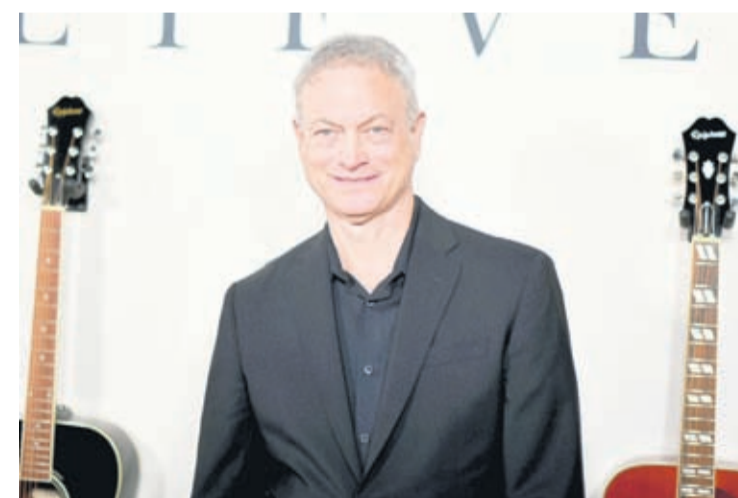
Gary Sinise attends the LA premiere of "I Still Believe," at ArCLight Hollywood, Saturday, March 7, 2020, in Los Angeles.